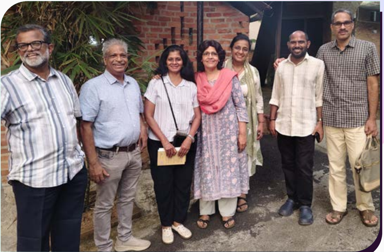
Alumni Members at the Trivandrum Chapter Meet

The president and secretary outlined the association’s completed projects and future plans. The planned alumni meet and conference generated particular interest and enthusiasm, and many members expressed their willingness to help.