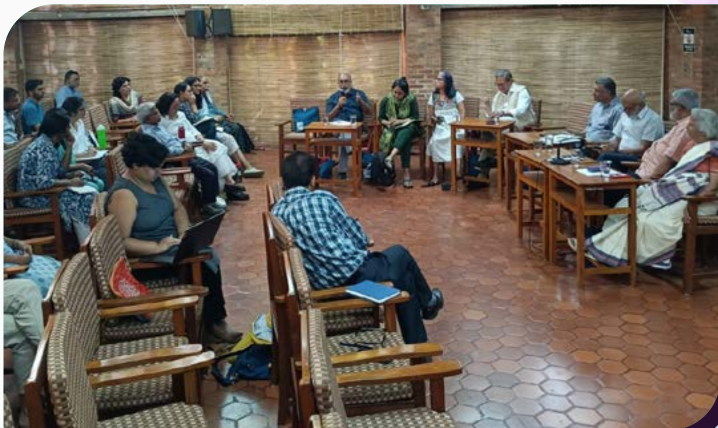
Participants at the Symposium

This implies that besides research on development patterns, perhaps we need to research disconnects themselves. This raises issues of power: which knowledge is allowed to count, and who decides it? Epistemic justice requires that we visibilise forms of knowledge outside the mainstream and include lived experience. As a proverb goes, "until the lion tells the story, the hunter will be glorified." Thus, often research from the outside is given more value than practice and practitioners' understanding, on the false premise that ordinary people cannot adequately think, interpret or create knowledge. It then becomes important to close this distance with more deliberate interaction between these worlds. For researchers, it calls for epistemic humility and pluralism as well as transdisciplinary orientation. Speakers also discussed the different orientations of researchers and practitioners. Researchers prioritize publications and abstractions while practitioners prioritize scale, speed, and measurable outcomes, and are accountable to politicians and funders.